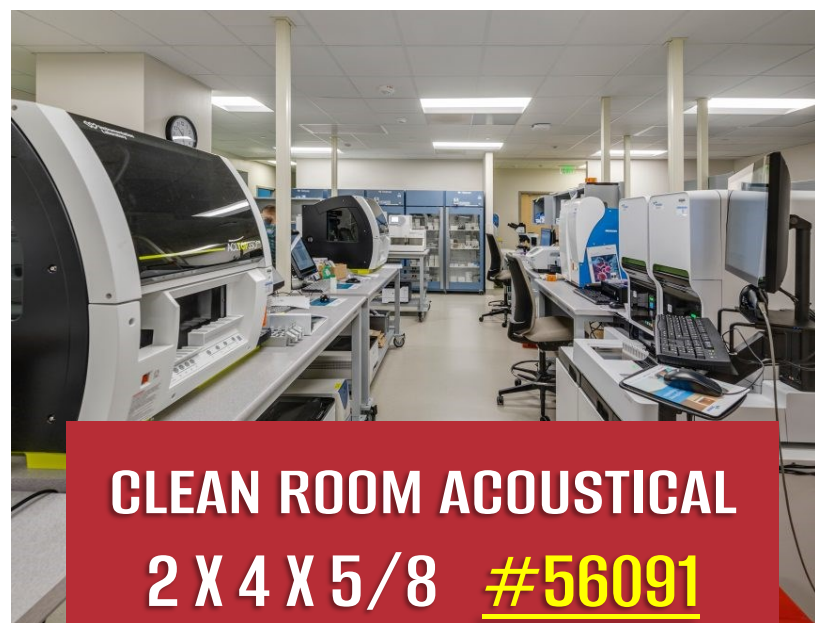
CLEAN ROOM ACOUSTICAL 2 X 4 X 5/8 #56091