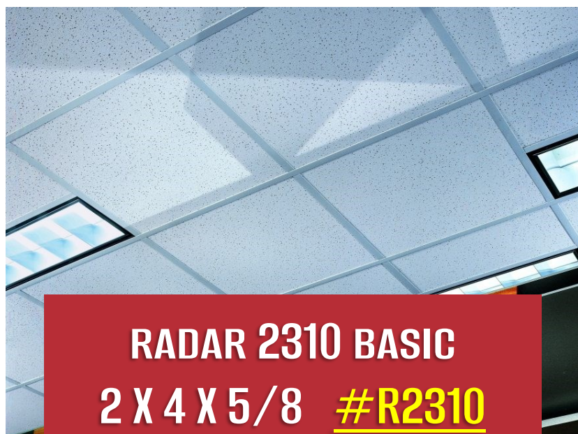
RADAR 2310 BASIC 2 X 4 X 5/8 #R2310