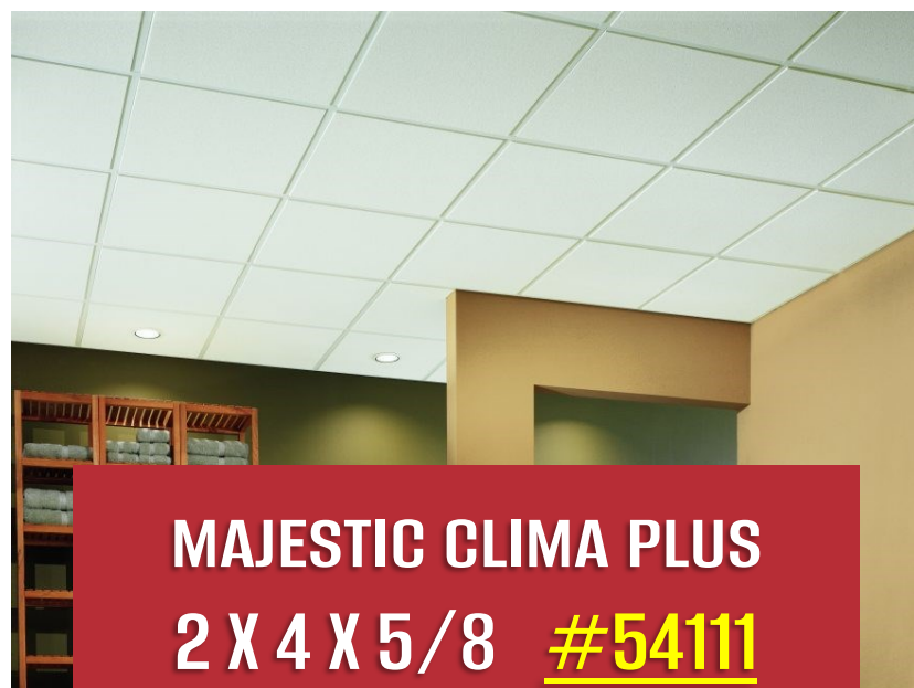
MAJESTIC CLIMA PLUS 2 X 4 X 5/8 #54111