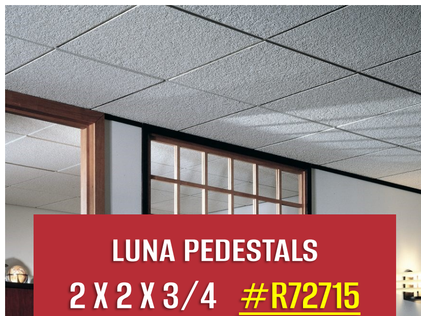
LUNA PEDESTALS 2 X 2 X 3/4 #R72715