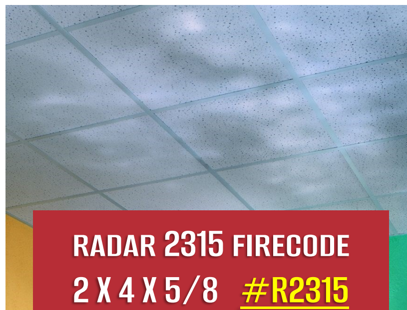
RADAR 2315 FIRECODE 2 X 4 X 5/8 #R2315