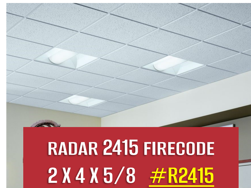
RADAR 2415 FIRECODE 2 X 4 X 5/8 #R2415