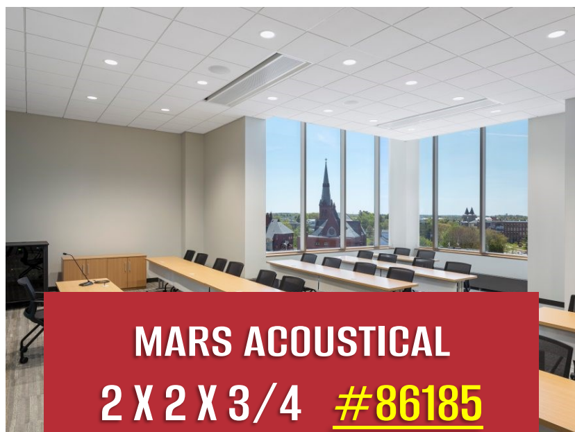
MARS ACOUSTICAL 2 X 2 X 3/4 #86185