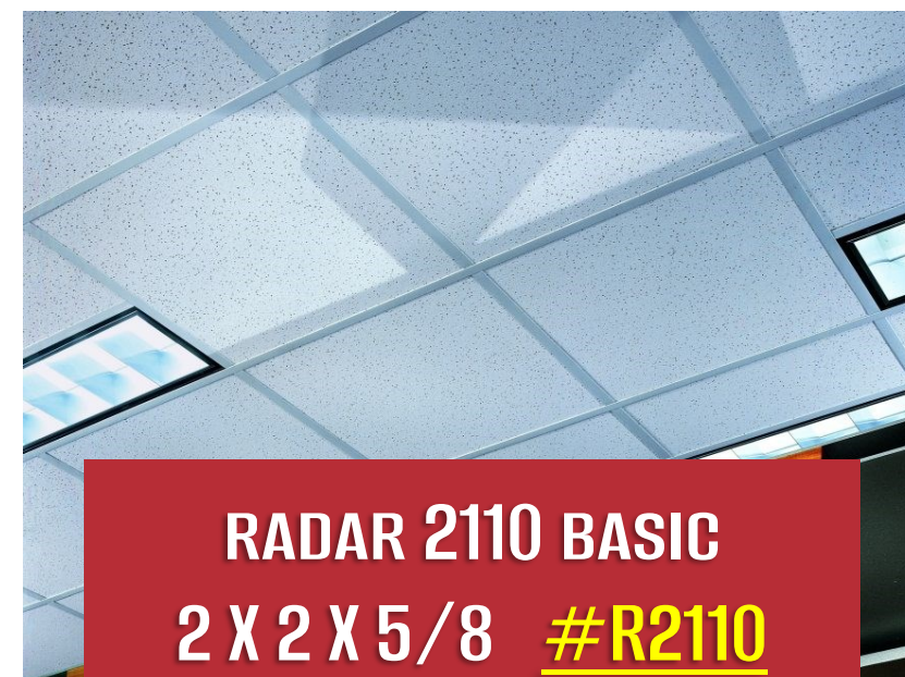
RADAR 2110 BASIC 2 X 2 X 5/8 #R2110

We also stock CGC Santa Fe™ and Dune 2 X 4 X 5/8 1773A & Smooth White 2 x 4 X 15/16 ceiling tiles from Armstrong